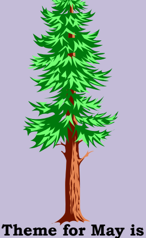
Theme for May is "Trees"